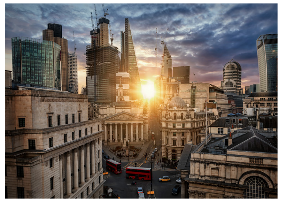
All details are correct at the time of writing (4 May 2023).

Financial advice and regular reviews are essential to help position your portfolio in line with your objectives and attitude to risk, and to develop a well-defined investment plan, tailored to your objectives and risk profile.